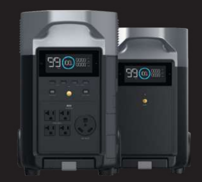
7.2kWh DELTA Pro + DELTA Pro Smart Extra Battery