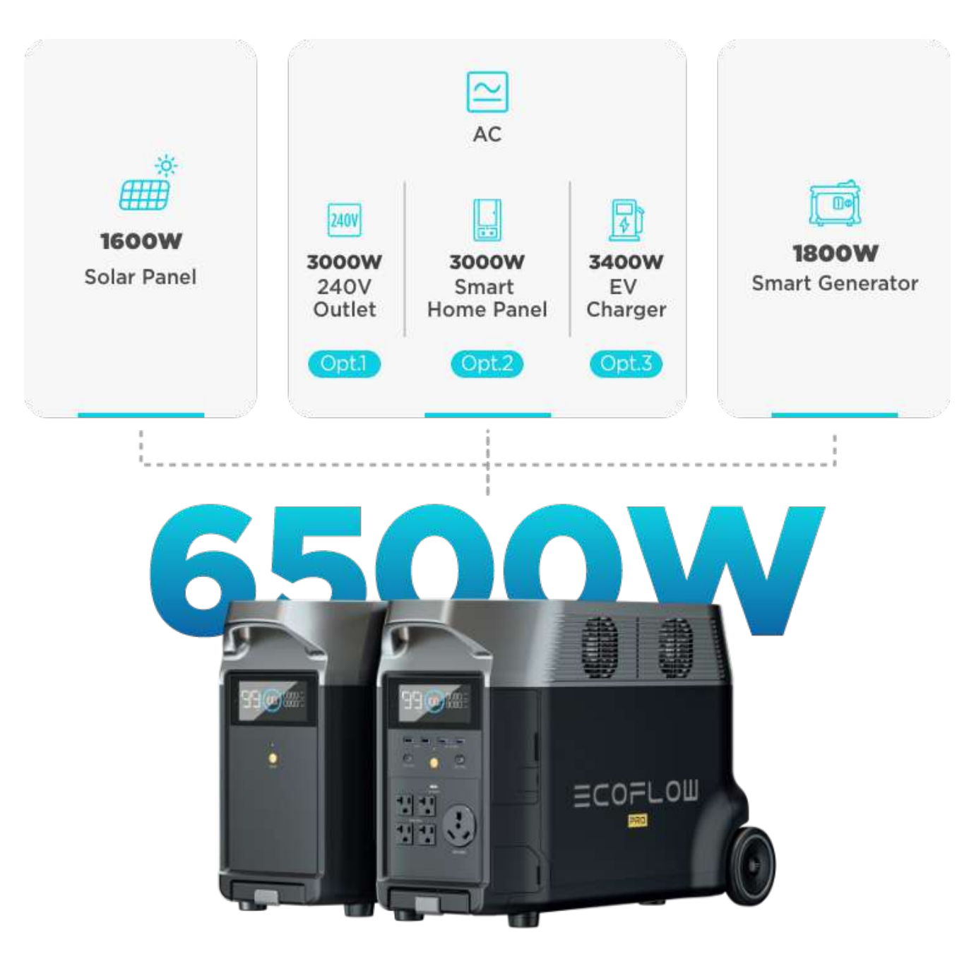
Requires DELTA Pro to be connected to a DELTA Pro Smart Extra Battery.

DELTA Pro is the world's fastest charging portable power station. Multiple charging delivers record-breaking speeds at 6500W. To reach 6500W, you can opt for one of these multiple charging methods.