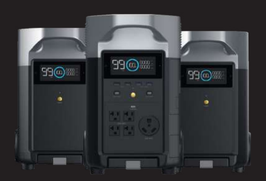
10.8kWh DELTA Pro + DELTA Pro Smart Extra Battery x 2